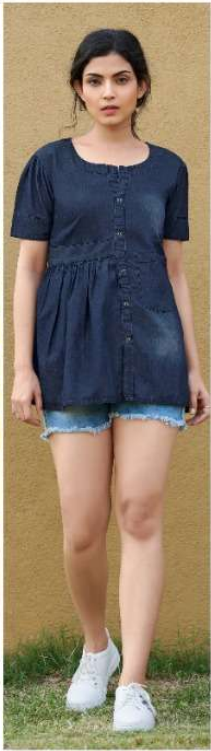
DESIGN - 8002