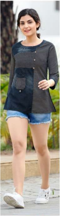
DESIGN - 8001