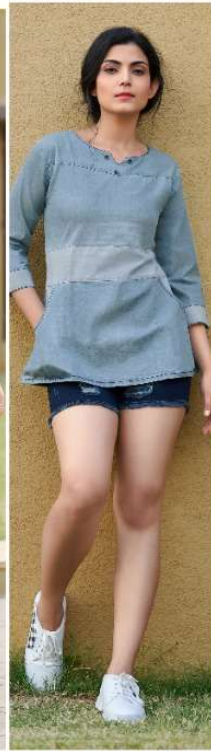
DESIGN - 8005