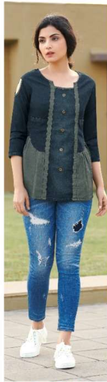
DESIGN - 8004