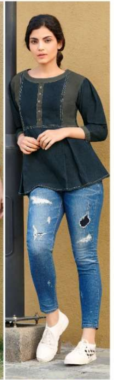
DESIGN - 8006