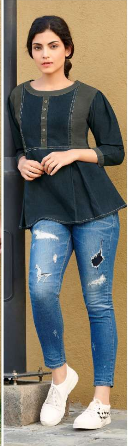
DESIGN - 6006