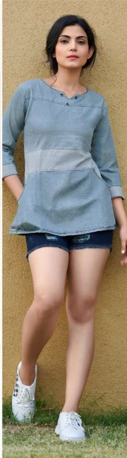
DESIGN - 6005