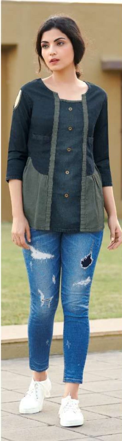
DESIGN - 6004