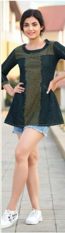
DESIGN - 8003